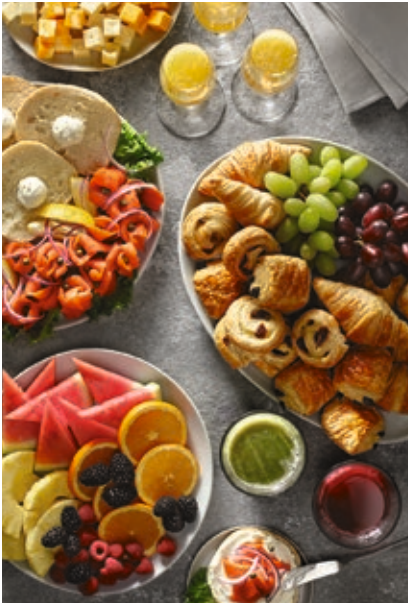
BRUNCH page 6