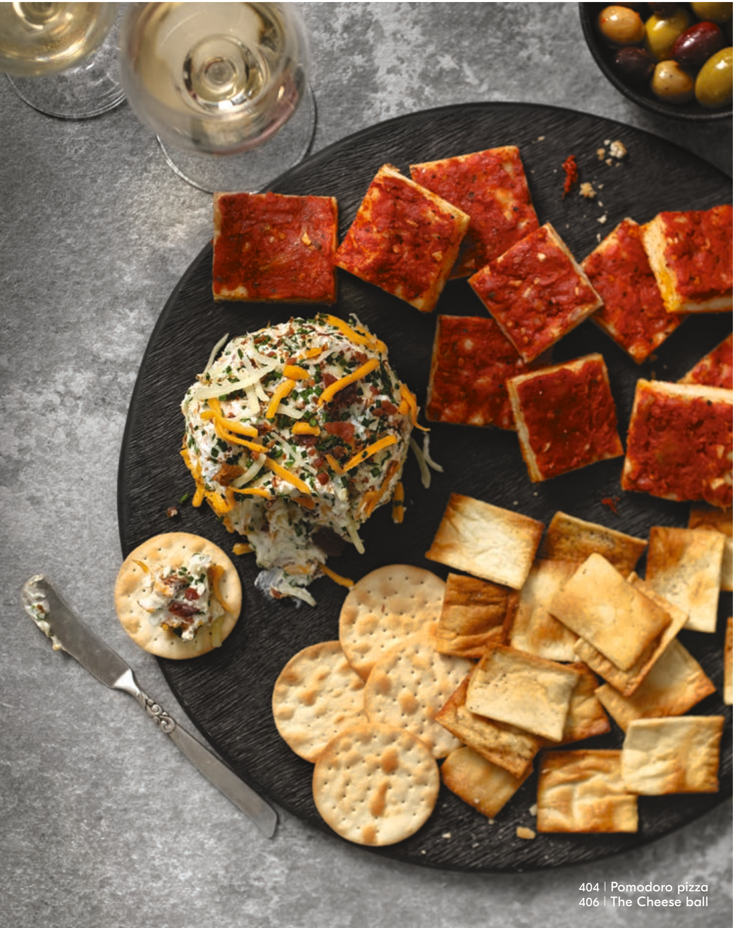
404 | Pomodoro pizza 406 | The Cheese ball