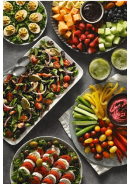
VEGETARIAN MENU page 8