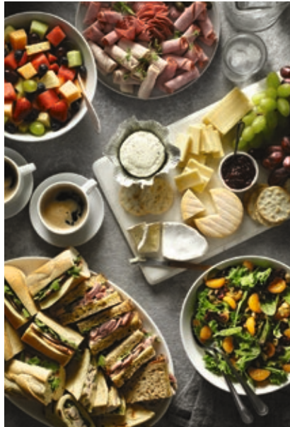
WORKING LUNCH page 7