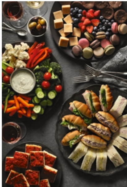
FAMILY GATHERINGS page 10