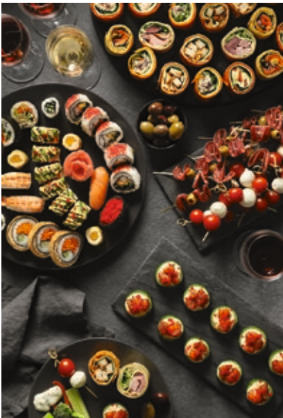
COCKTAILS page 9